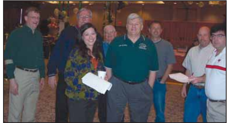
Board of Directors Tour Ocean City Conference Site.

We are having a good year and a fun year. We hope to see you at the conference and be active in our chapter. We have a lot of areas for you to show your expertise.