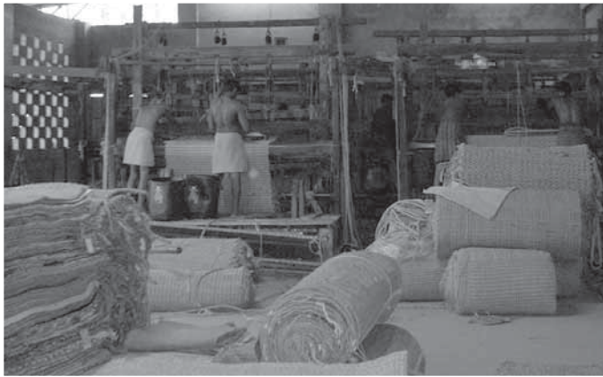
Indian Laborers Making Mats and Rugs.